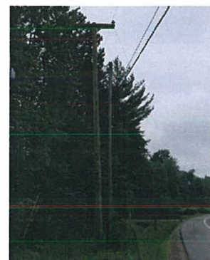
E-31B/43 - T-145/NT

E-31B/42 - T-145/197 (Existing joint owned utility pole (PSNH/Fairpoint) in existing Right-of-Way)