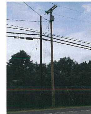
E-31B/42 - T-145/197

NHOS proposes to install a 1/4 inch metal supporting strand between the existing utility poles shown above that will traverse the Railroad. The strand will be installed at the proposed height (see above). The supporting strand will be secured to each pole using double dead end attachments to prevent any sag in the wire and maintain proper clearances. NHOS will lash a one inch diameter fiber optic cable (PVC jacket) to the strand using a dual lash method to provide security of the fiber over the right of way. The fiber will be tagged with twenty four hour contact information at each pole clamp. NHOS will employ the proper safety personnel during the crossing installation. The proposed install will meet all proper clearances from other Utilities. (see above). Additional pole guys will be added per NESC Rule 264 and as directed by pole owners.